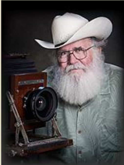
Clyde Butcher, nationally recognized landscape photographer

In partnership with Aqua Condominiums and LaPlaya Resort, ECA sponsored a reception and seminar featuring nationally recognized landscape photographer Clyde Butcher. The evening event was an exclusive invitation opportunity for ECA's members, Board of Directors, partners and sponsors.